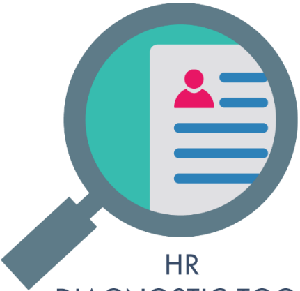
HR DIAGNOSTIC TOOL