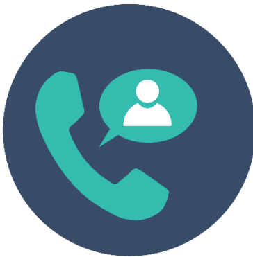
HR RETAINER SERVICE